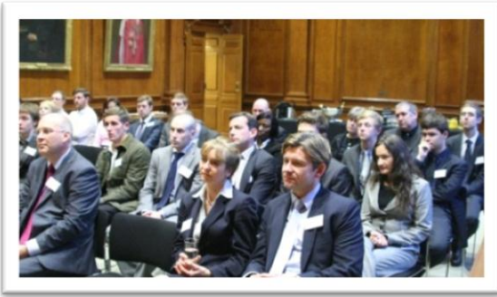
Above: attendees at the ceremony