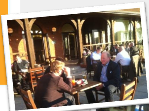
Left: players enjoy a drink after play at the London Club